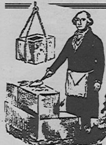
The trowel used by George Washington to lay the cornerstone of the Capitol at Washington in 1793 has been used since by seven other Presidents of the United States for great and important undertakings.

EMESSAY NOTES • Published by: The Masonic Service Association Of the United States 8120 Fenton St. Silver Springs, Md. 20910 • Telephone (301) 588-4010 Fax (301) 608-3457